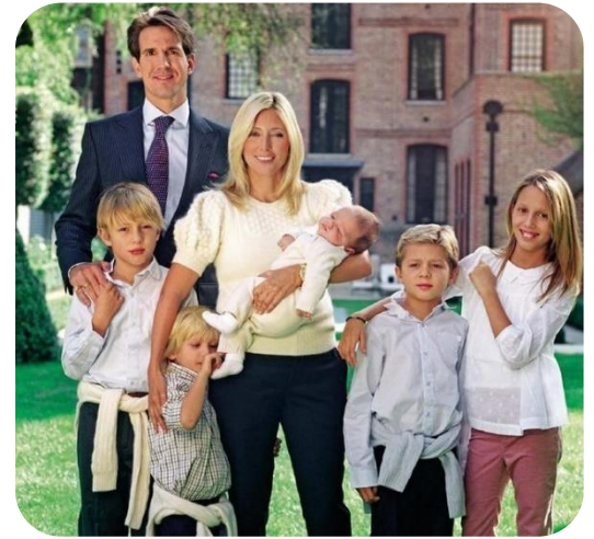
Top Left-The Inside Cover Photo from the Marie-Chantal Catalog - Featuring Prince Pavlos of Greece, Princess Marie-Chantal of Greece and their 5 Children - Olympia, Constantine, Achileas, Odysseas, and Aristide.